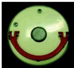
Locking mechanism in locked position