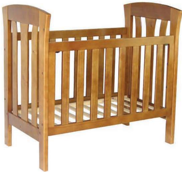
Instructions for Vogue Cot CCD 200

info@lovencare.com.au www.lovencare.com.au